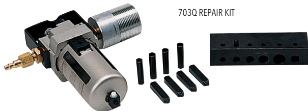
703Q REPAIR KIT