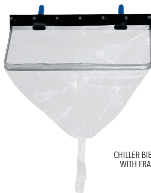
CHILLER BIB BAG WITH FRAME