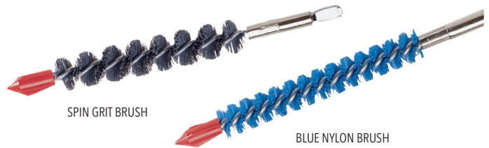
SPIN GRIT BRUSH