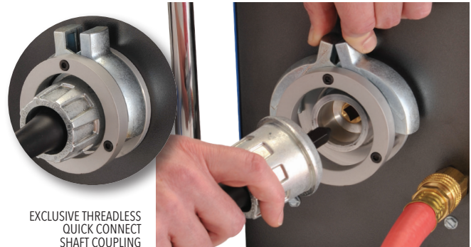
EXCLUSIVE THREADLESS QUICK CONNECT SHAFT COUPLING

The cleaning tool safely and effectively scours debris away without damaging tube walls. A casing around the shaft feeds water to the rotating tool, flushing out deposits as they are loosened. The RAM-4 is one of the most effective weapons you can use to optimize your system's power requirements.